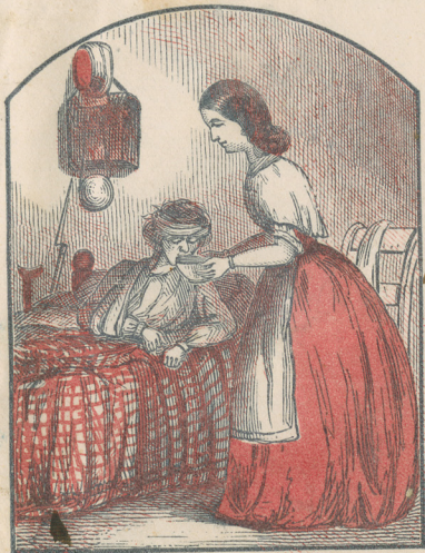
THE PATRIOT WOMAN.

We take care of the brave soldiers who have fought our battles.